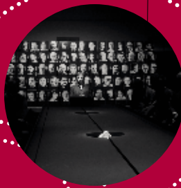
Mausier directed by Theodoros Terzopoulos as part of Masters in Residence, premiered in October 2013